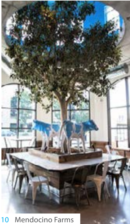
10 Mendocino Farms