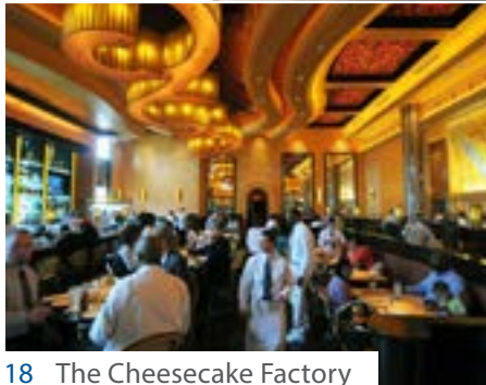
18 The Cheesecake Factory