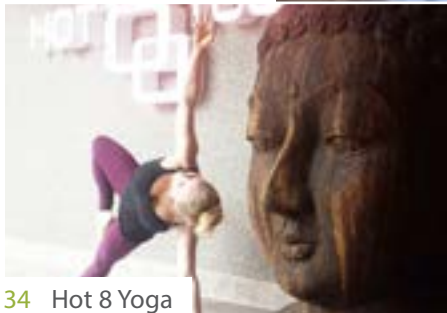
34 Hot 8 Yoga