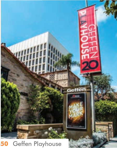
50 Geffen Playhouse